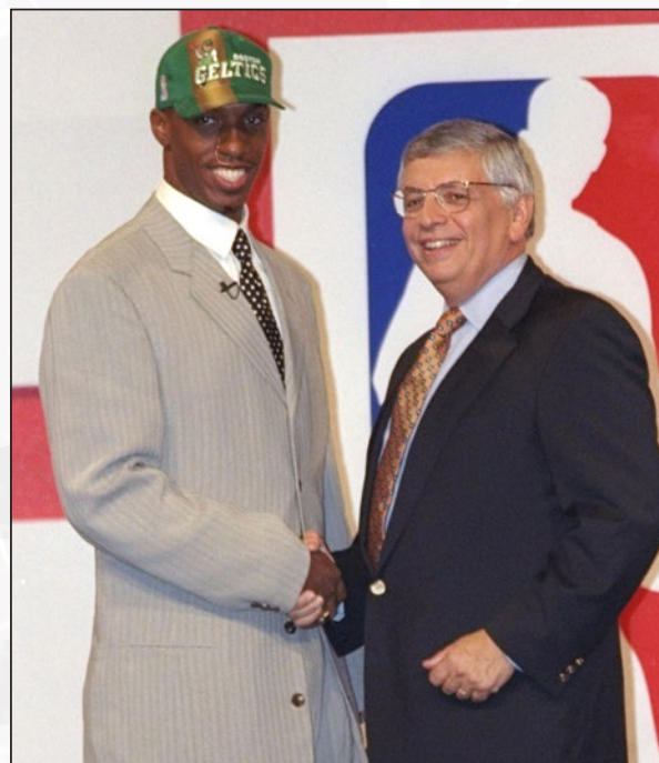
Chauncey Billups became CU's first-ever lottery pick in the 1997 NBA Draft.